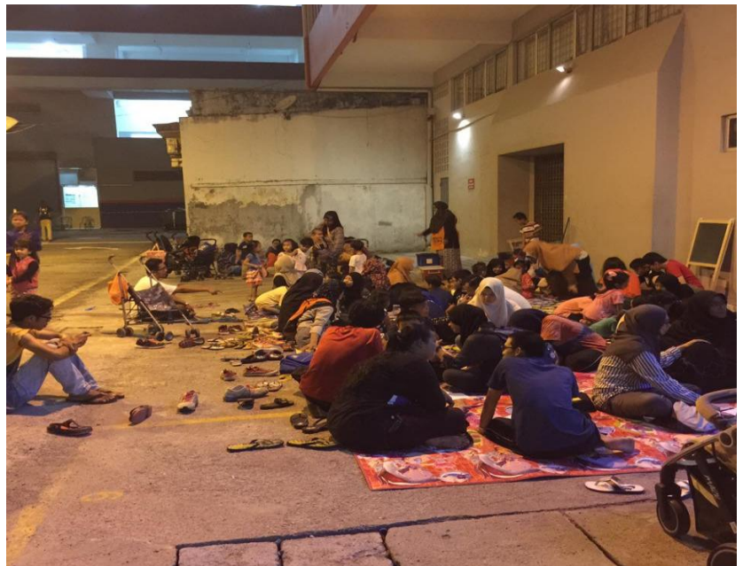
Figure 2 Our Classes Start at 8pm to 11pm